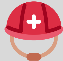
SEARCH AND RESCUE OPERATIONS