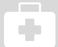
FIRST AID/ MEDICAL SUPPORT